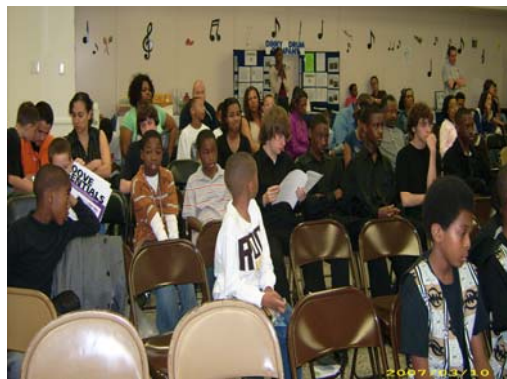
Attendees at “It’s All About the BEAT”.

Last but not least we had the Percussion Center onsite for attendees to purchase any needed percussion equipment. The Houston community benefited tremendously from this day of percussion and we did a lot of work but had a lot of fun.